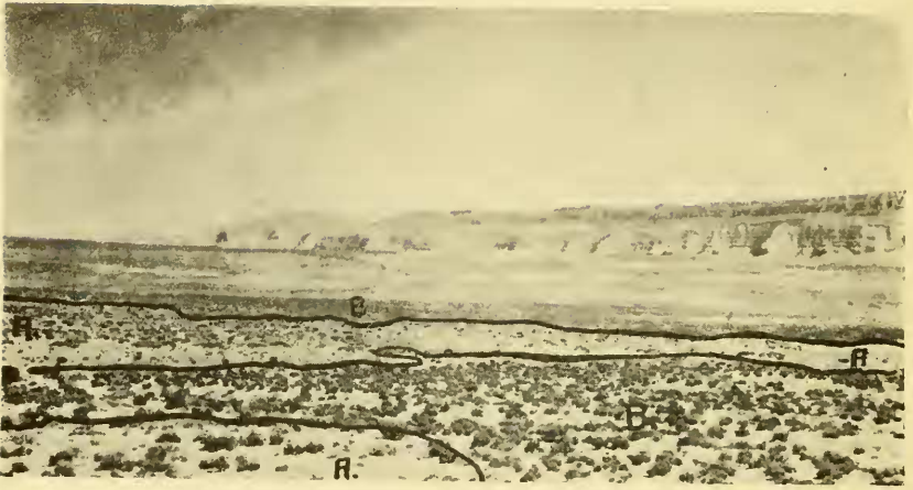
Figure 5. Colcogyne-Krameria associes at Willow Spring Tank looking south-east showing the straight cliffs with Navajo Mountain at the end. The light areas (A) are mainly Krameria while the dark areas (B) are mainly Colcogyne .